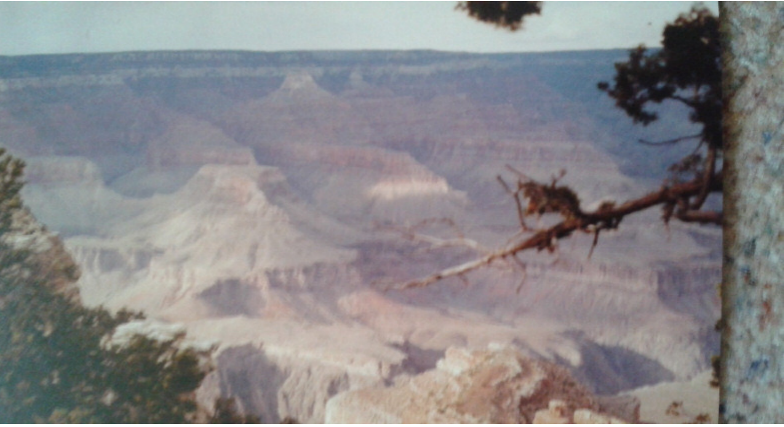
Picture credit: Stratigraphy in The Grand Canyon, USA, 1992. From Helen Gavaghan's personal collection.

Fred Pearce argues we live in an anthropocene where people dominate geophysical reality and can shape a human future.